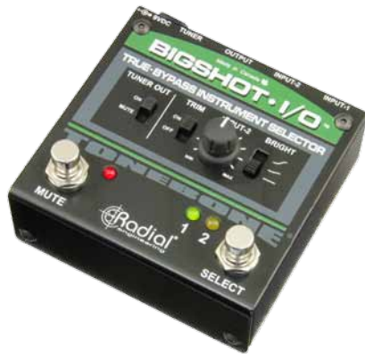
BigShot i/o - Order # R800 7202

The Radial BigShot i/o is an easy to use instrument selector that lets you quickly switch between two instruments and send the signal to your amp. In the most basic application the BigShot i/o is 100% true-bypass for the most demanding purist. To further enhance connectivity input-2 is equipped with a set-&-forget level control called DIM that lets you reduce the signal from the louder of your two instruments so that the output from both instruments are matched. When passive instruments are used, a unique 'bright' switch lets you compensate for high frequency loss due to longer cables.