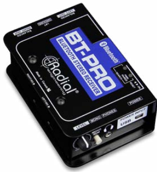
BT-Pro - Order # R800 1055 00

The BT-Pro™ is a Bluetooth™ direct box designed to capture the wireless transmission from a Bluetooth enabled device and convert the signal to a balanced line for use in a PA system. To maximise reception, an innovative T-shaped access cavity has been developed, behind which is located the antenna. The antenna is protected by a milled insert made from Sintra - a rugged closed-cell PVC - which allows the wireless transmission signal to pass without interference for reception distances to 20 meters (60'). The audio signal path employs the latest Bluetooth wireless A2DP interface over 2.0 EDR (Enhanced Data Rate) for higher speed transmission and better audio quality. Inside, the BT-Pro converts the data to a stereo analog signal, producing up to +4dB at the output. The signal level is controlled by a front panel potentiometer that is shared with the built-in headphone amp. This features a standard 3.5mm mini TRS and is used for trouble shooting. For greater flexibility, a stereo-to-mono switch is provided that sums the input for dual-mono operation to reduce channel requirements on the mixer. Should noise be encountered, two side-mounted isolation transformers may be inserted into the signal path to eliminate ground loops. This is augmented with a ground lift switch for the XLRs to further help eliminate noise.