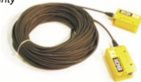
That's a lot of cable! No problem for the SGI