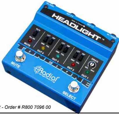
Headlight - Order # R800 7096 00

The Tonebone Headlight™ is a compact guitar amp selector that allows up to 4 amplifiers to be selected using a single footswitch. Depending on how many amps are connected, the SELECTOR footswitch will rotate through the outputs and advance them one amp at a time. A series of high-visibility LED indicators follow the active output to provide instant visual feedback on stage. Outputs 2, 3 and 4 are transformer isolated to eliminate hum and buzz caused by ground loops. These outputs are further augmented with individual ground lift switches to reduce noise and a 180° polarity reverse switch to phase-align all of the amps. A MUTE footswitch turns off all of the outputs for quiet on-stage tuning. This can also be set so that when depressed, all four amps are turned on at once. As with all Radial products, the Headlight is made from 14-gauge steel for maximum durability and shielding against stray magnetic fields. Powering is done using a standard 9V supply with a typical pedalboard power brick.