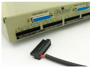
DB-25 connectors make interfacing multi-track recorders easy. Euro-blocks reduce install time for installations.

PARALLEL INPUTS on DB-25 and Euro-block in addition to front panel XLRs.