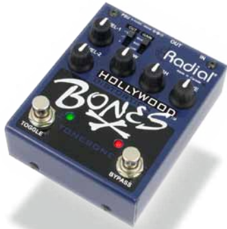
Bones Hollywood - Order # R800 7100

The Hollywood is a compact dual-function distortion pedal that delivers the tone and dynamics of today's American-made high gain amplifiers. The design begins with Radial's unique class-A FET front end buffer. A variable Drive™ control works in conjunction with the 3-position Gain switch by first setting the general distortion range for low, medium or high levels and then fine tuning to suit.