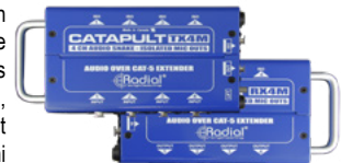
The Catapult TX4M and RX4M.