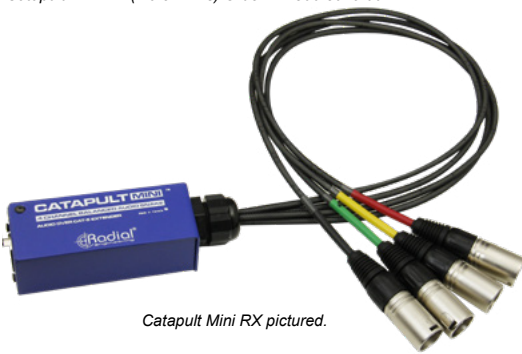
Catapult Mini RX pictured.

Catapult Mini TX (Female XLRs) Order # R800 8028 00 Catapult Mini RX (Male XLRs) Order # R800 8029 00